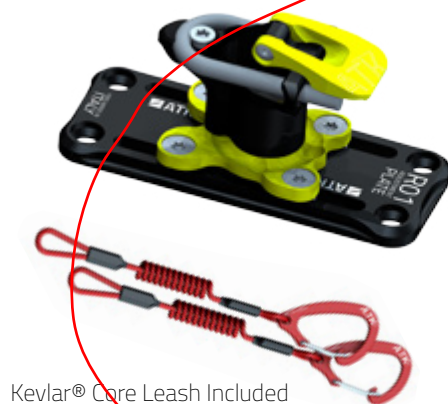
Kevlar® Core Leash Included

SLR Logic 4, SLR Logic 6, SLR Logic 8, SLR Logic 10.